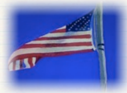
Oil Painting~Mattie Kildow ~Title :Our Flag